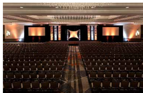
New York Marriott at the Brooklyn Bridge