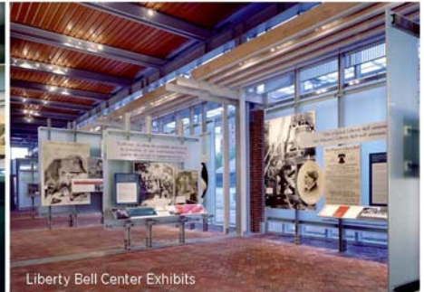
Liberty Bell Center Exhibits