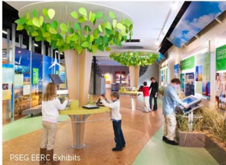
PSEG EERC Exhibits