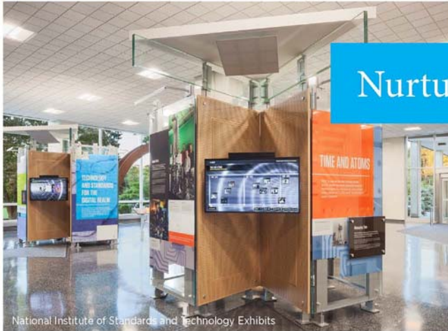
National Institute of Standards and Technology Exhibits