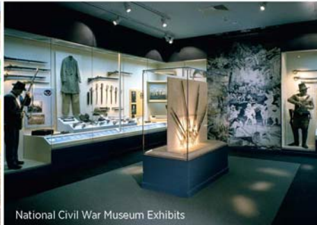
National Civil War Museum Exhibits