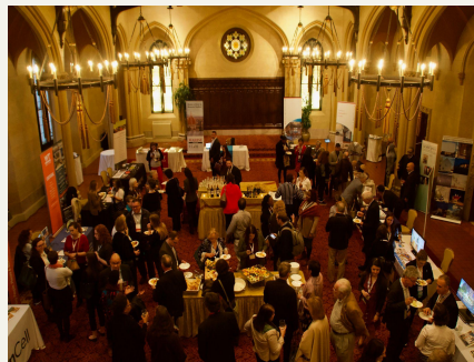
Attendance & Expectations