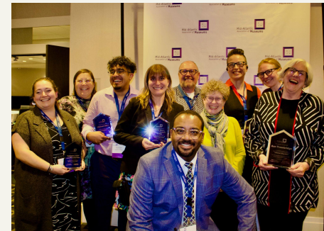
Commitment to MAAM Values